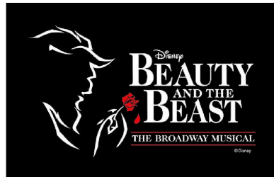
Sponsored by Renew Mental Health & Wellness June 7-9, 2024