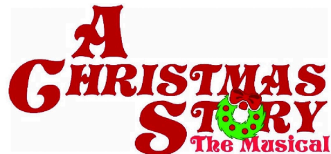
December 6-8, 2024