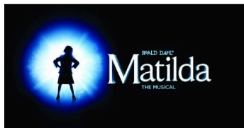
September 6-8, 2024